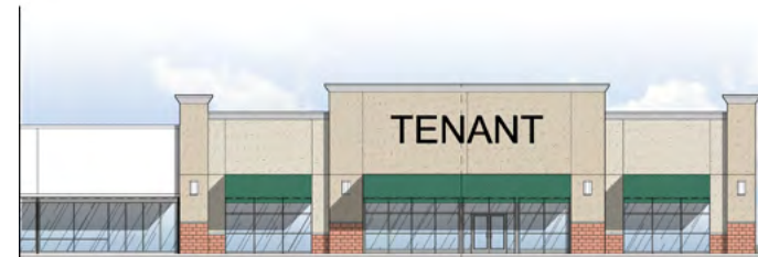
20,000 sf – One Tenant