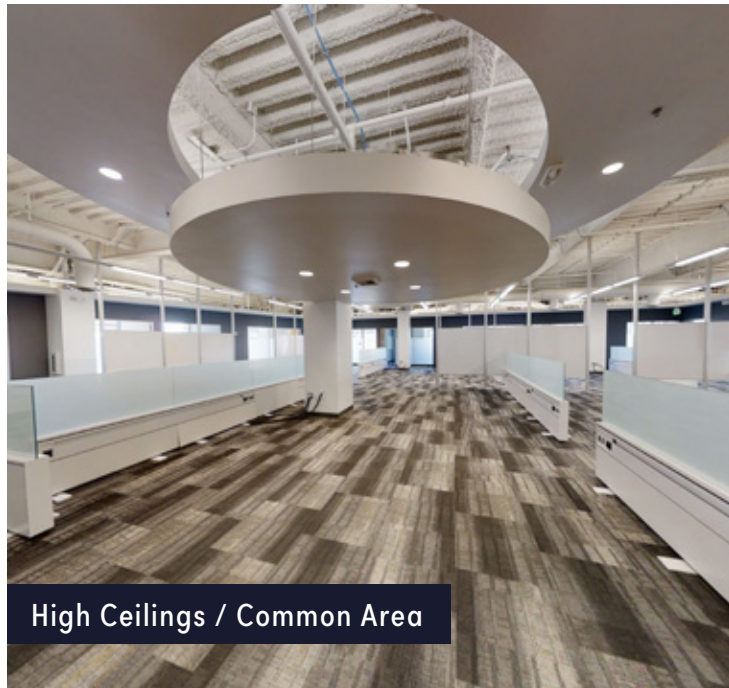
High Ceilings / Common Area