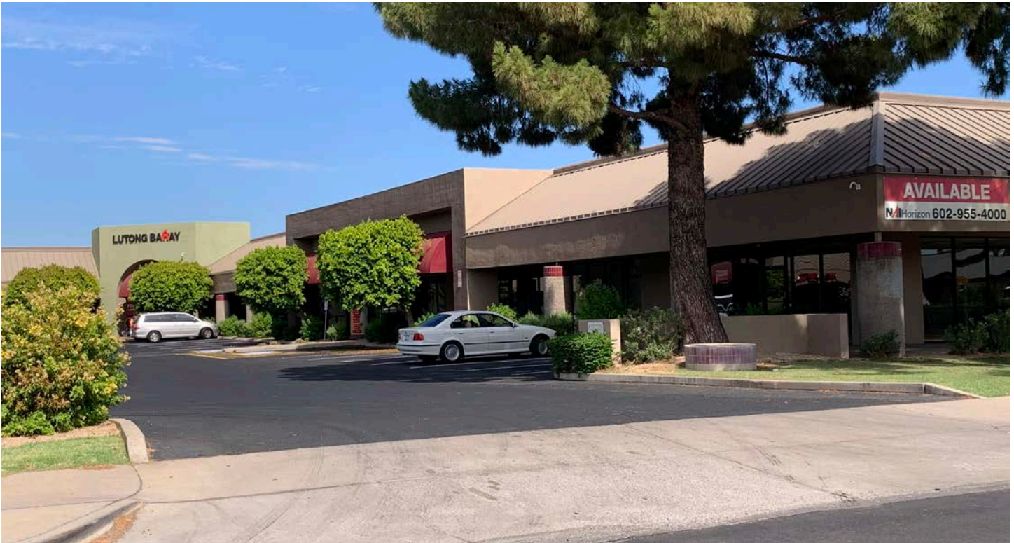
Well maintained center

For Lease Olive Crossing 1,531 - 2,350 SF