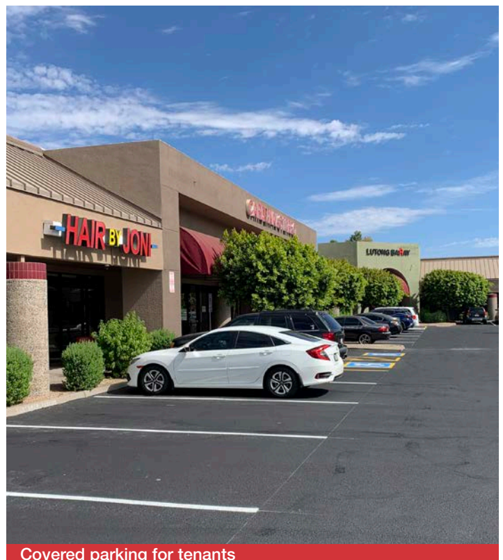
Covered parking for tenants

Matt Harper, CCIM 602 393 6604 matt.harper@naihonorizon.com