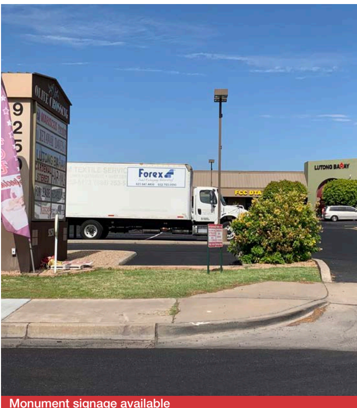
Monument signage available