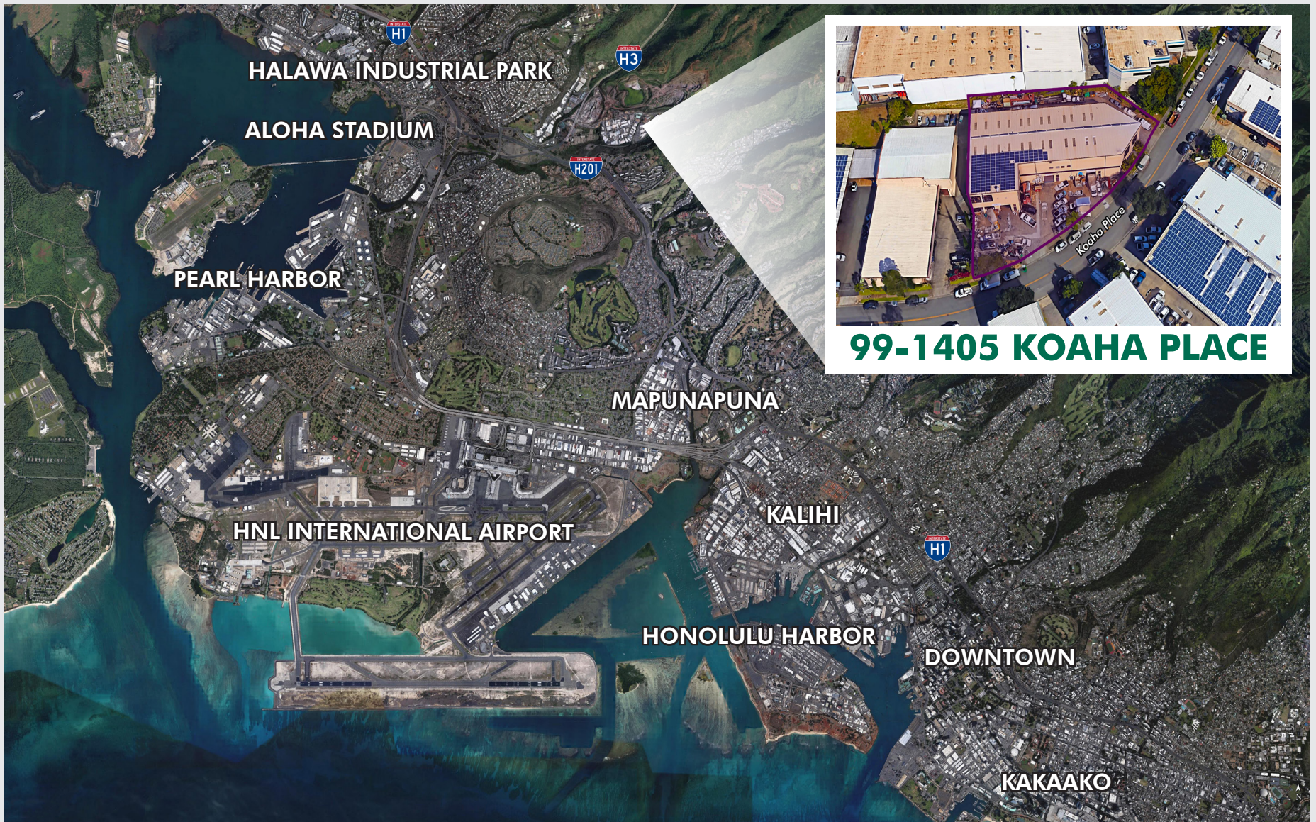
99-1405 KOAHA PLACE

© 2022 CBRE, Inc. All rights reserved. This information has been obtained from sources believed reliable, but has not been verified for accuracy or completeness. You should conduct a careful, independent investigation of the property and verify all information. Any reliance on this information is solely at your own risk. CBRE and the CBRE logo are service marks of CBRE, Inc. All other marks displayed on this document are the property of their respective owners, and the use of such logos does not imply any affiliation with or endorsement of CBRE. Photos herein are the property of their respective owners. Use of these images without the express written consent of the owner is prohibited.