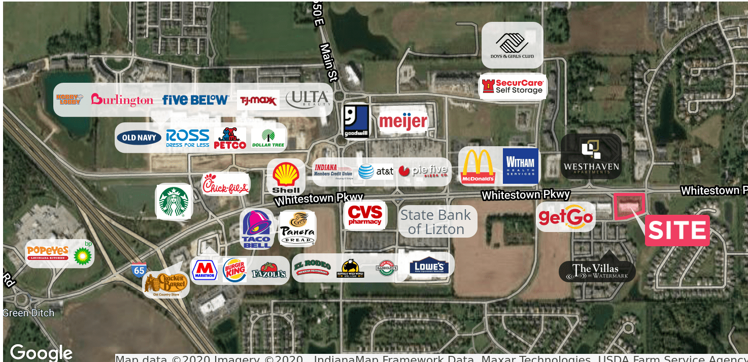
Map data ©2020 Imagery ©2020 , IndianaMap Framework Data, Maxar Technologies, USDA Farm Service Agency

7145-7163 EAST WHITESTOWN PARKWAY, WHITESTOWN, IN 46077