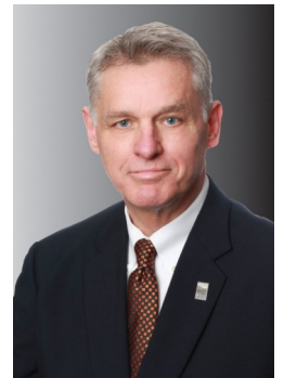
DENNIS P. BUSH ALC

Note: Also available For Lease $15.00 per SF NNN