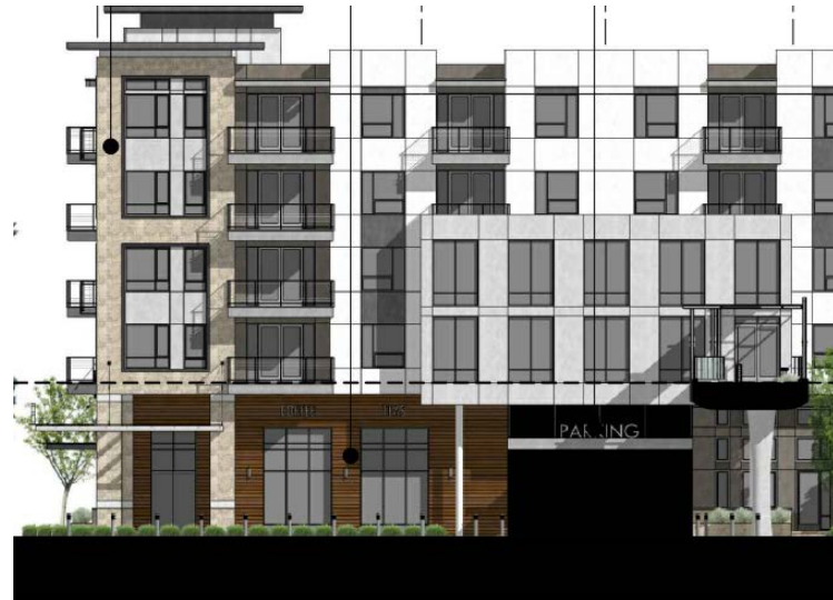
PEDESTRIAN PLAZA ELEVATION

DELIVERY PROJECTED LATE 2021 OPENING SUMMER 2022