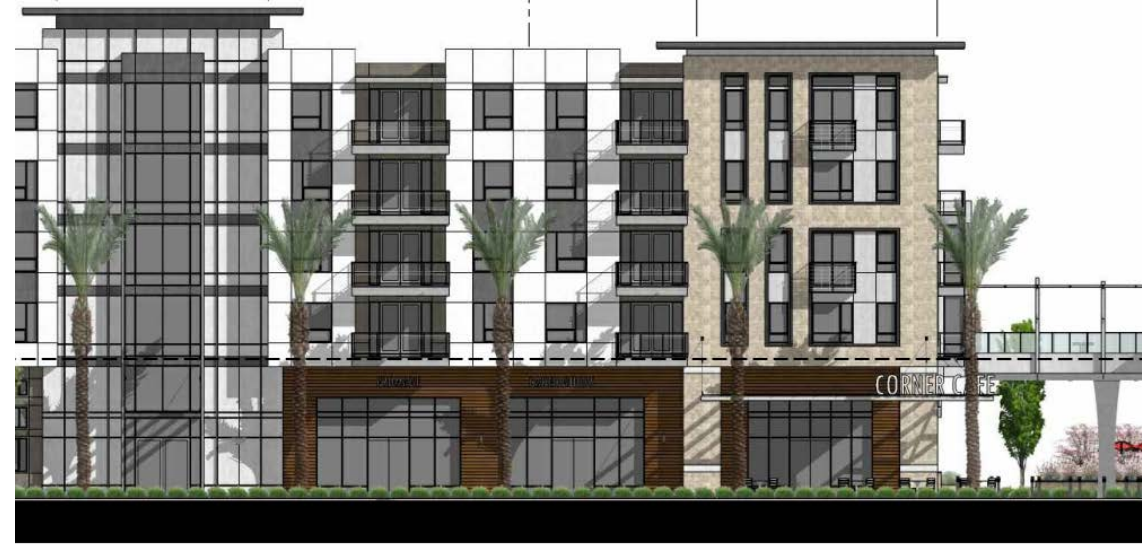
ANTON BOULEVARD ELEVATION