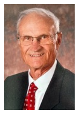
2225 S. Blackman Road Springfield, MO 65809

T 417.881.0600 C 417.848.0611 bob@rbmurray.com MO #1999022566