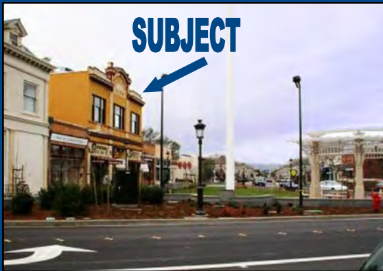
Flagpole Plaza, Downtown Livermore