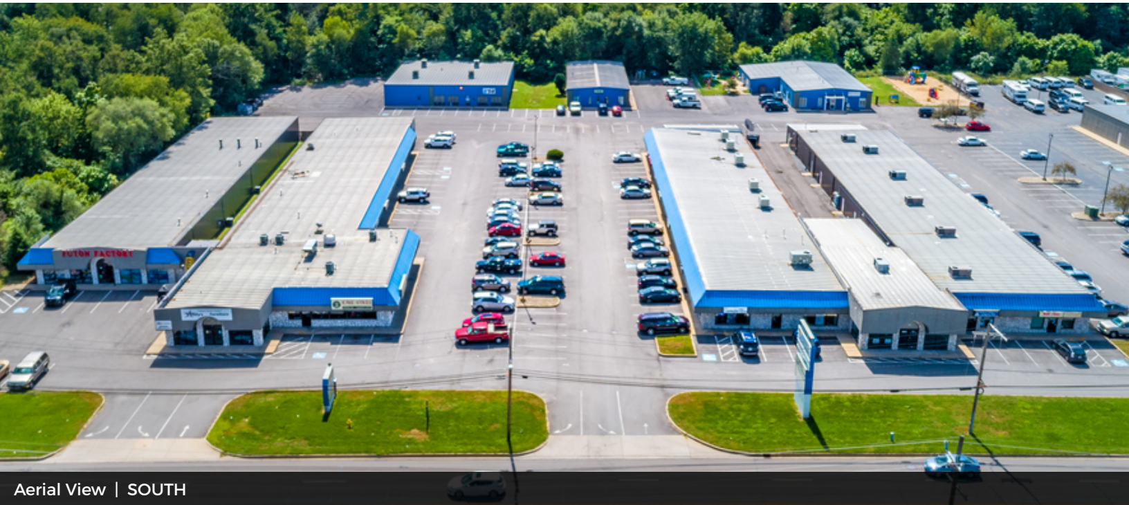
Aerial View | SOUTH