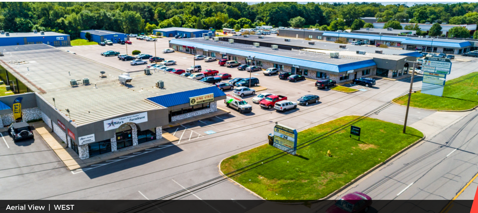
Aerial View | WEST