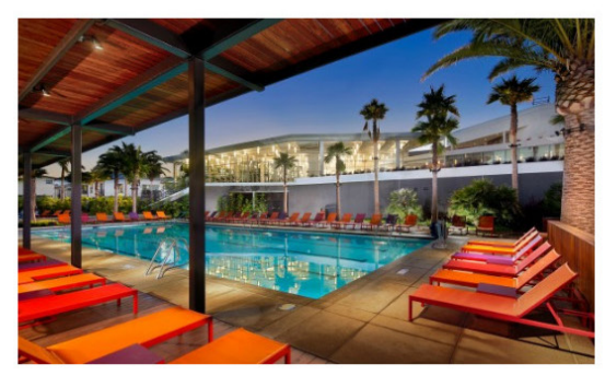
The Resort at Playa Vista