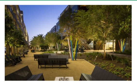
The Campus at Playa Vista