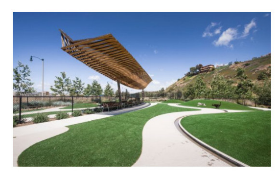
Bluff Creek Fields