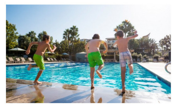
The Centerpointe Club