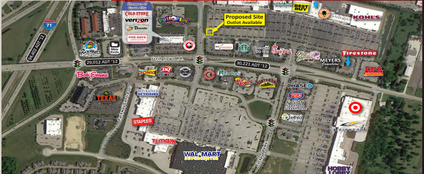
Grove City, Ohio, NE Corner of Stringtown Rd. & Thistlewood Dr.