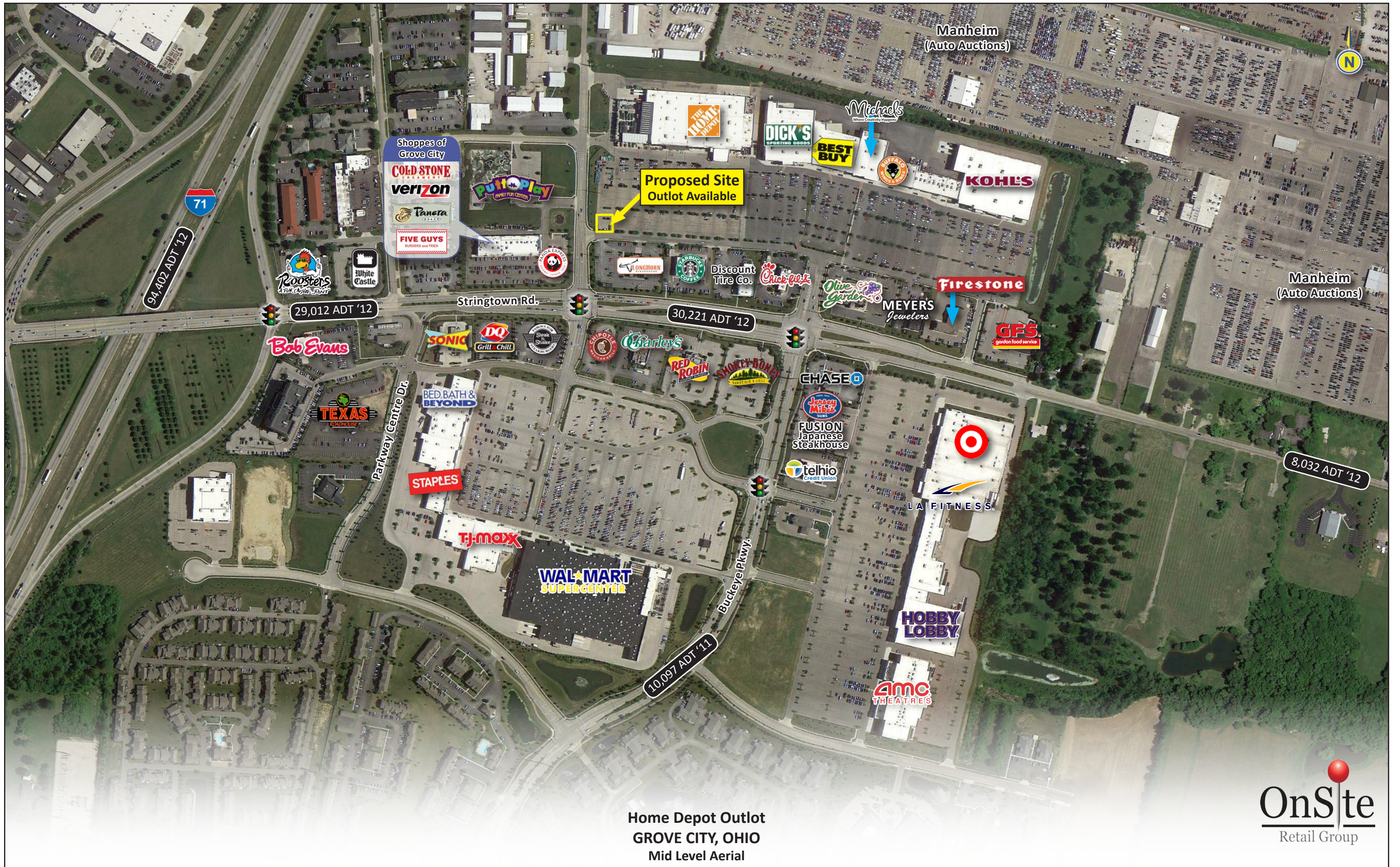
Home Depot Outlot GROVE CITY, OHIO Mid Level Aerial