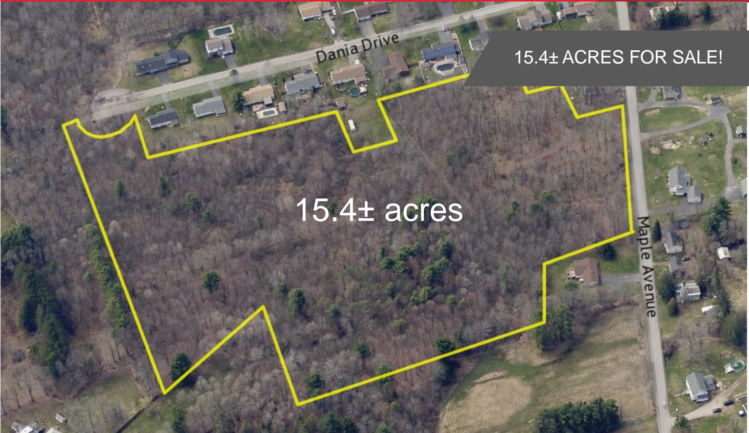
Approximate site lines; subject to survey verification