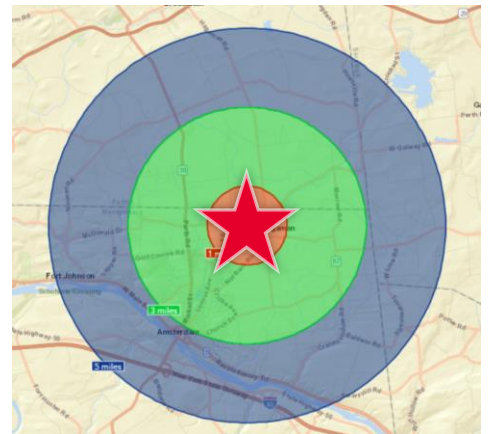
Radius Map: Ring Band of 3-5 miles