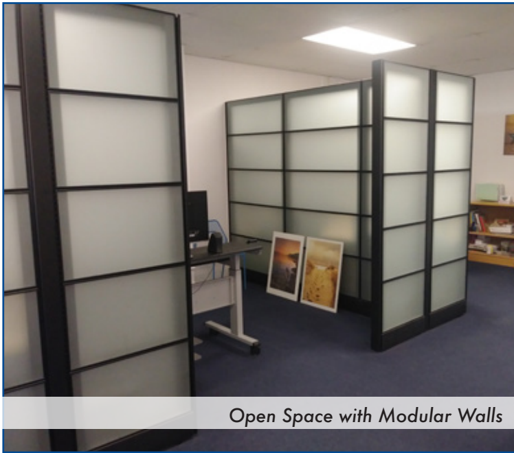
Open Space with Modular Walls

605 MARKET STREET South Financial District