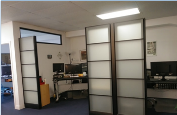
Open Work Area