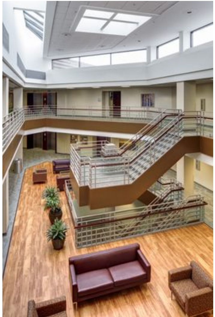
Second Floor Lobby