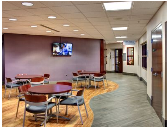
First Floor Lobby