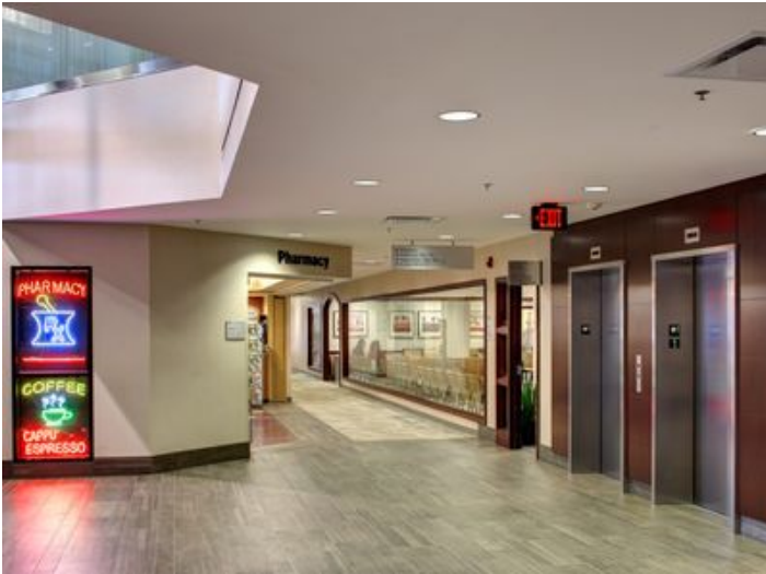
Pharmacy & Radiology