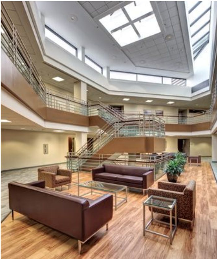
Second Floor Lobby