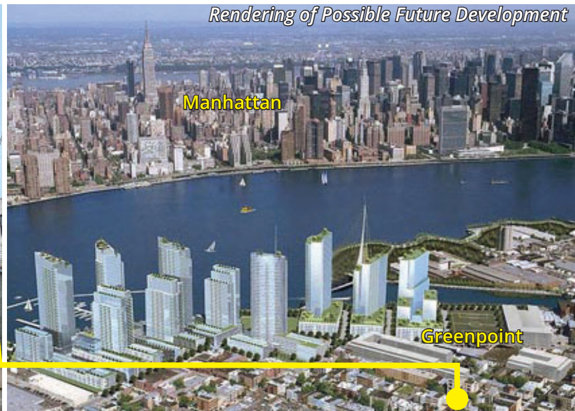
Rendering of Possible Future Development

EXCELLENT USER OR 1031 EXCHANGE PROPERTY!