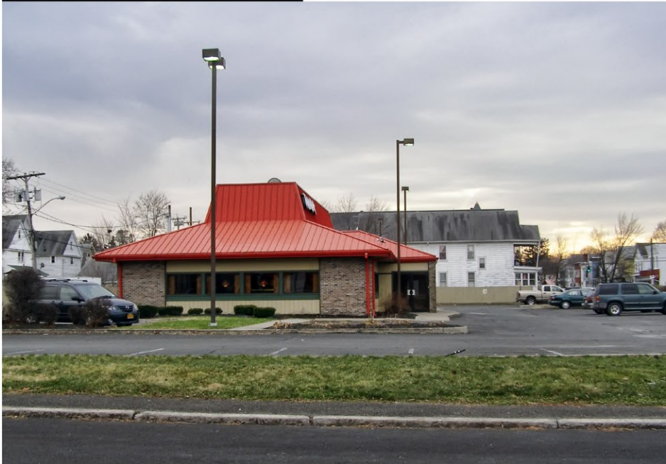
SIDE BUILDING VIEW