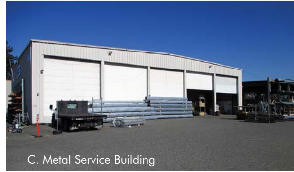
C. Metal Service Building