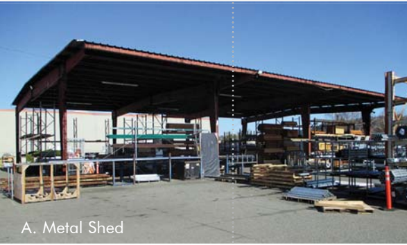
A. Metal Shed