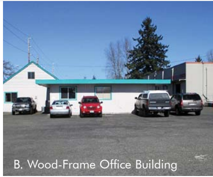
B. Wood-Frame Office Building