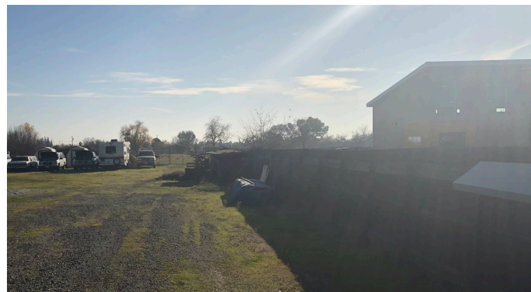
CLOCKWISE FROM TOP: Office // Gravel lot // Parking // Map View