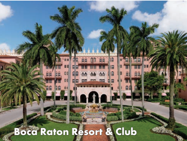
Boca Raton Resort & Club