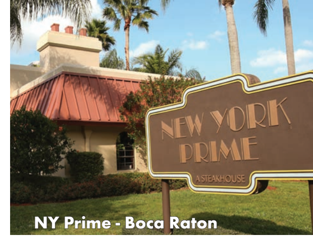
NY Prime - Boca Raton