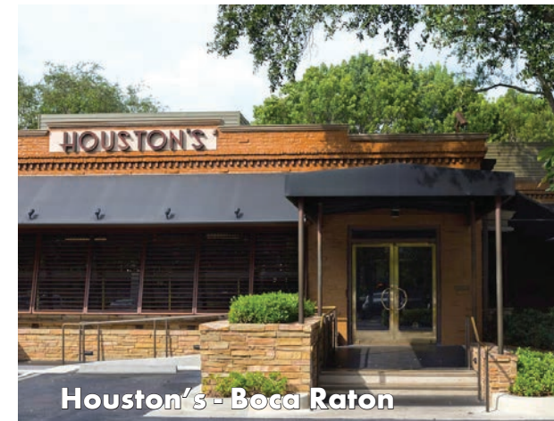
Houston's - Boca Raton