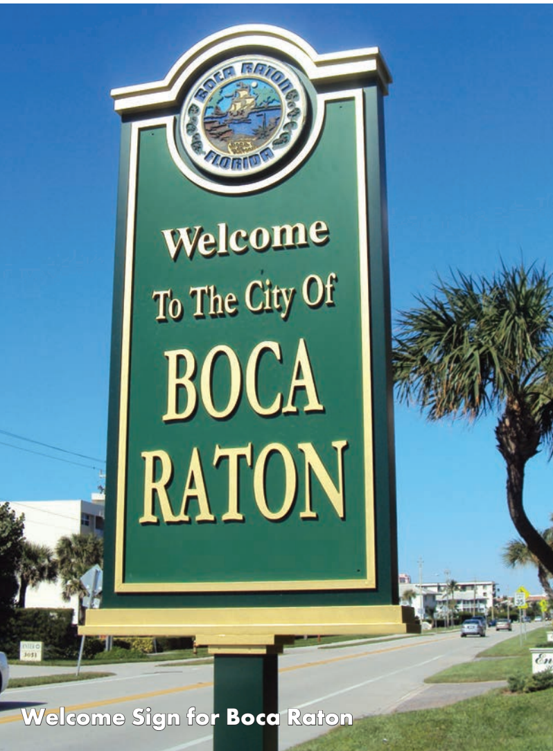
Welcome Sign for Boca Raton