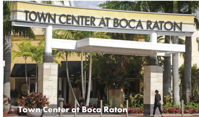
Town Center at Boca Raton