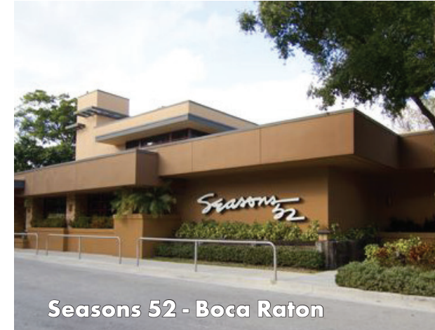
Seasons 52 - Boca Raton