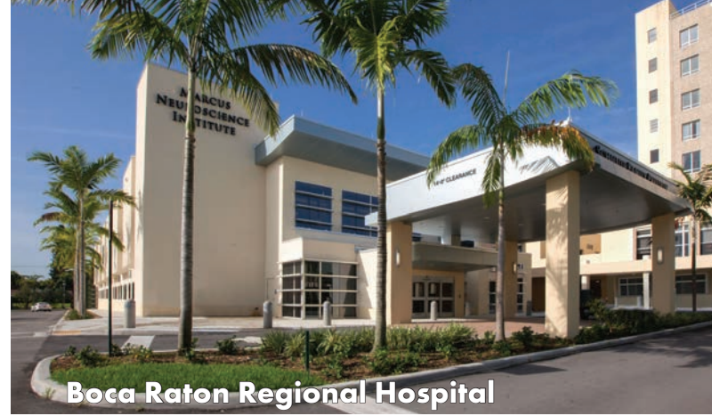
Boca Raton Regional Hospital