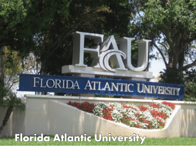
Florida Atlantic University