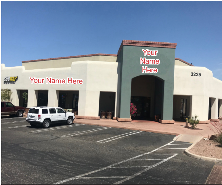
Suite A-103-105: ±3,025 SF End Cap Restaurant Space