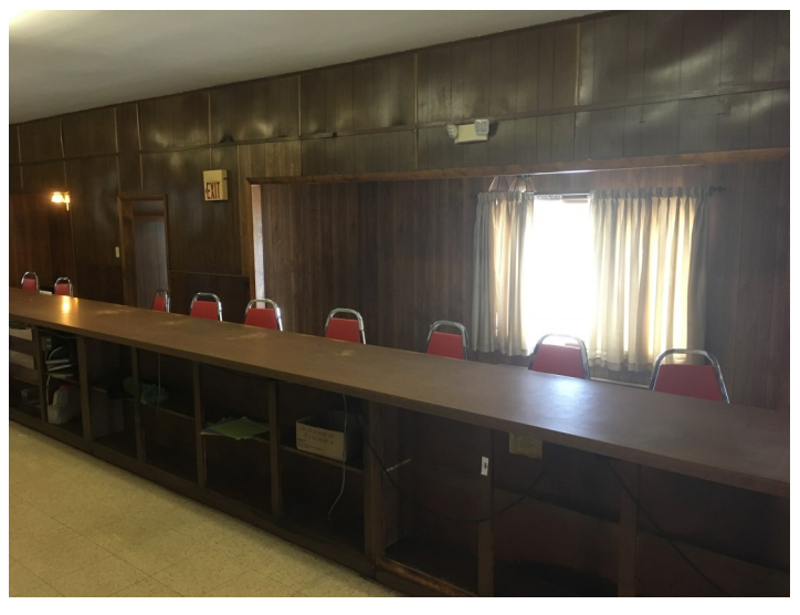
Disclaimer: Information obtained from sources deemed to be reliable. However, we make no guarantee, warranty or representation. Information, prices, and other data may change without notice.