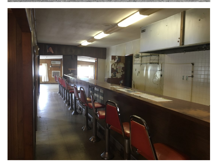
Disclaimer: Information obtained from sources deemed to be reliable. However, we make no guarantee, warranty or representation. Information, prices, and other data may change without notice.