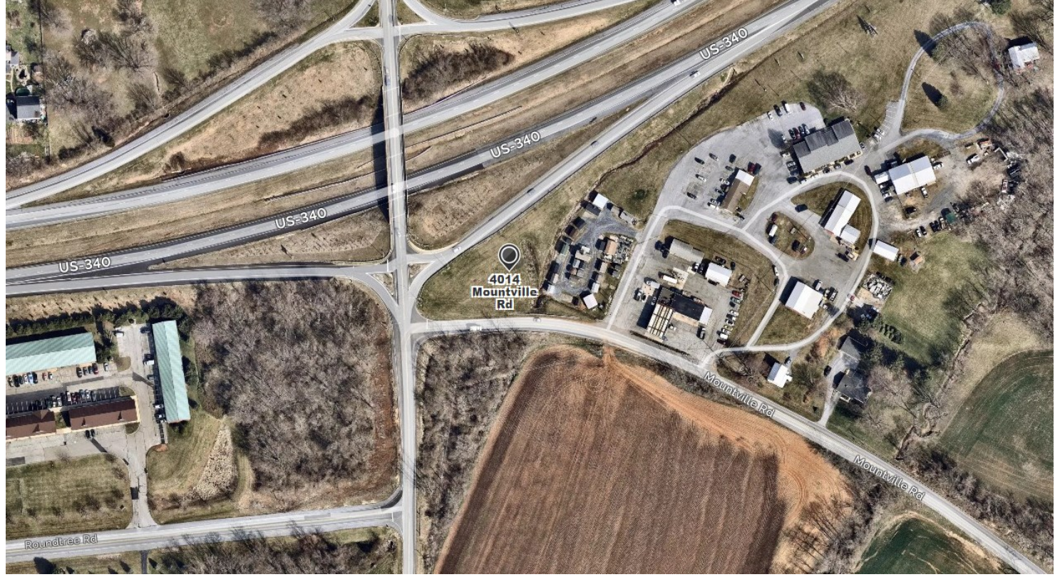
Disclaimer: Information obtained from sources deemed to be reliable. However, we make no guarantee, warranty or representation. Information, prices, and other data may change without notice.