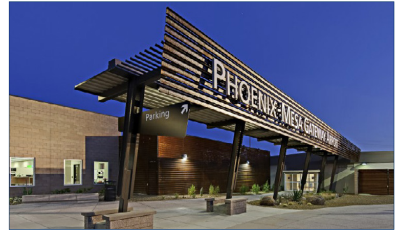
PHOENIX-MESA GATEWAY AIRPORT

Queen Creek, in the southeast corner of Maricopa County, Arizona is within 10 minutes of Phoenix-Mesa Gateway Airport and 45 minutes of Sky Harbor International Airport. This small town is an oasis in the East Valley of the Phoenix metropolitan area.