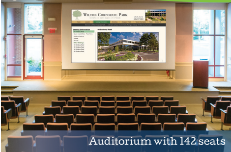
Auditorium with 142 seats

Central Location · Extensive Amenities · Sustainable Design · Sound Ownership & Management