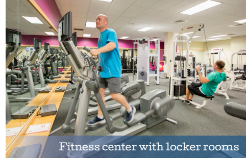
Fitness center with locker rooms