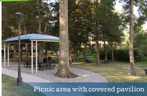
Picnic area with covered pavilion