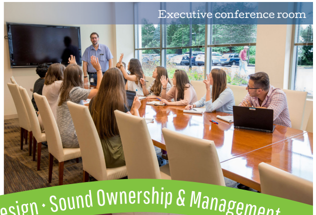
Executive conference room

Central Location · Extensive Amenities · Sustainable Design · Sound Ownership & Management