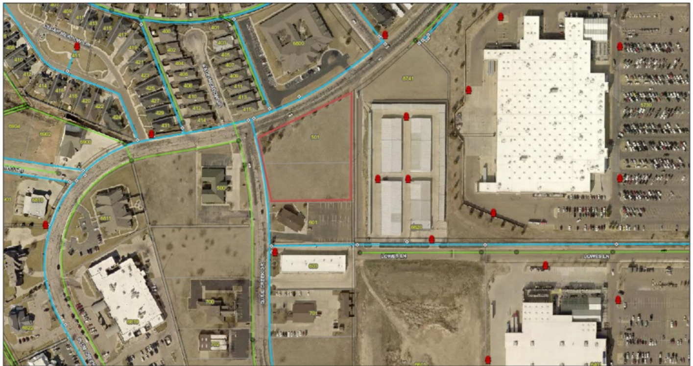
Water and Sewer Map