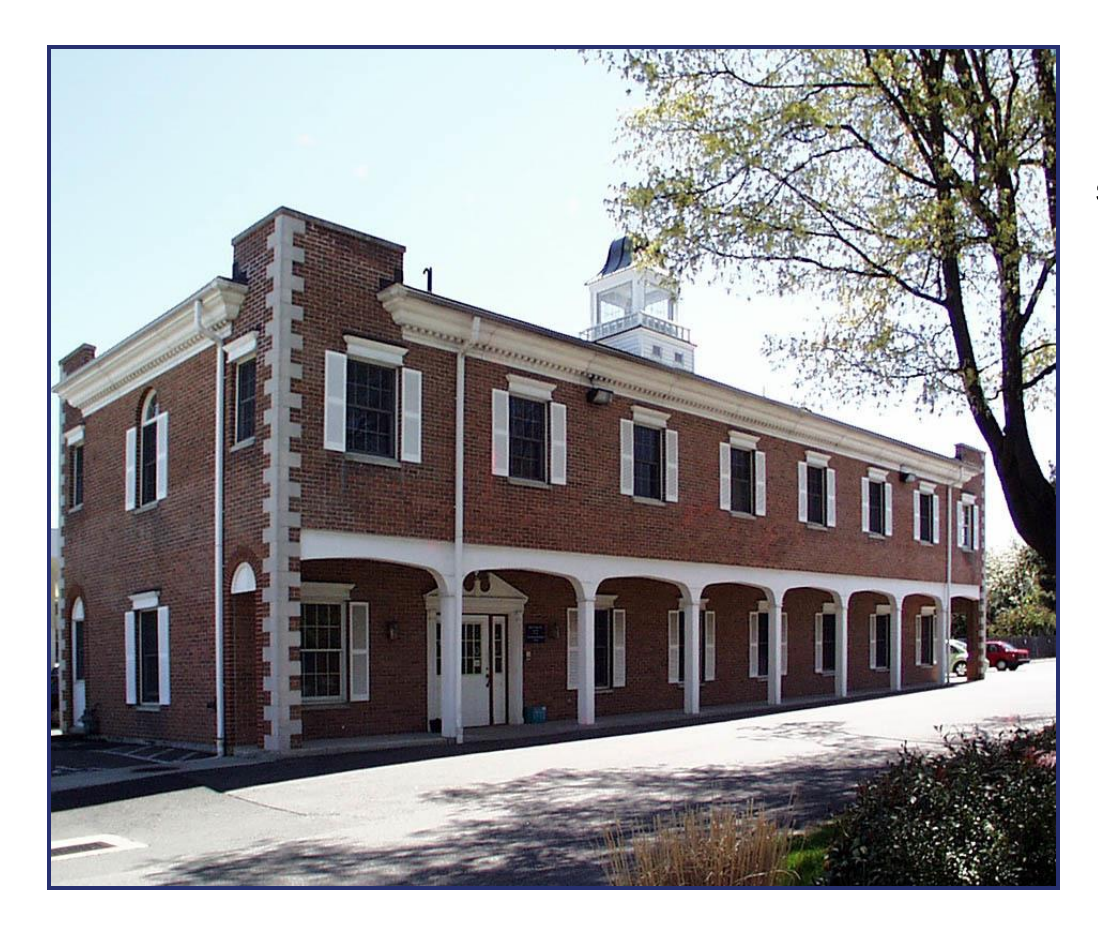
Located in the Heart of Fairfield