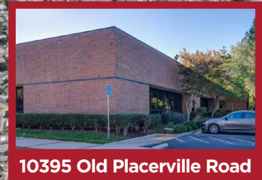
10395 Old Placerville Road