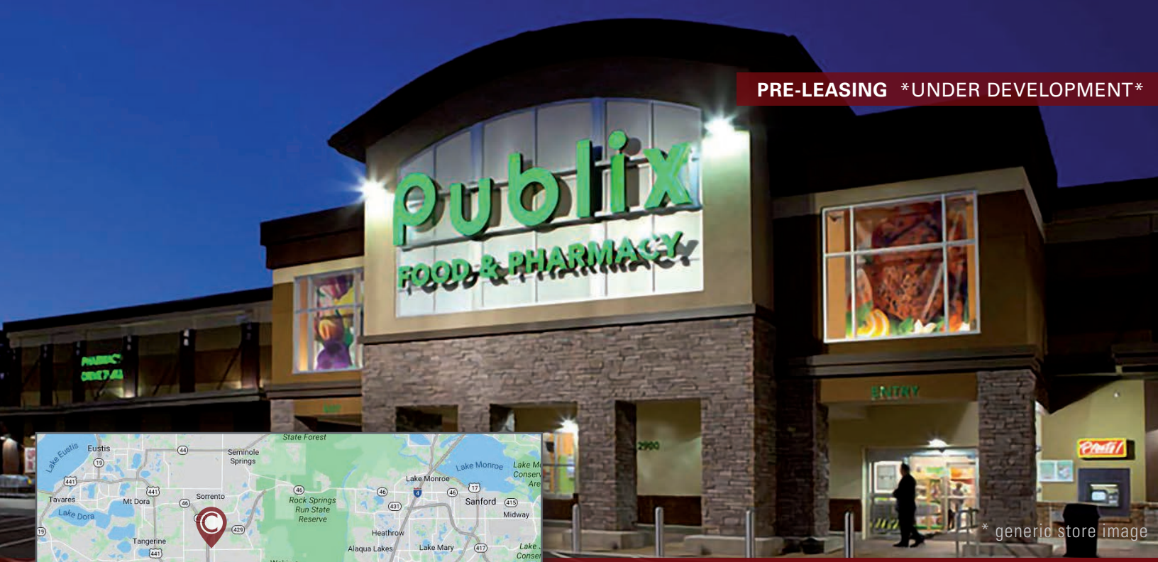
* generic store image