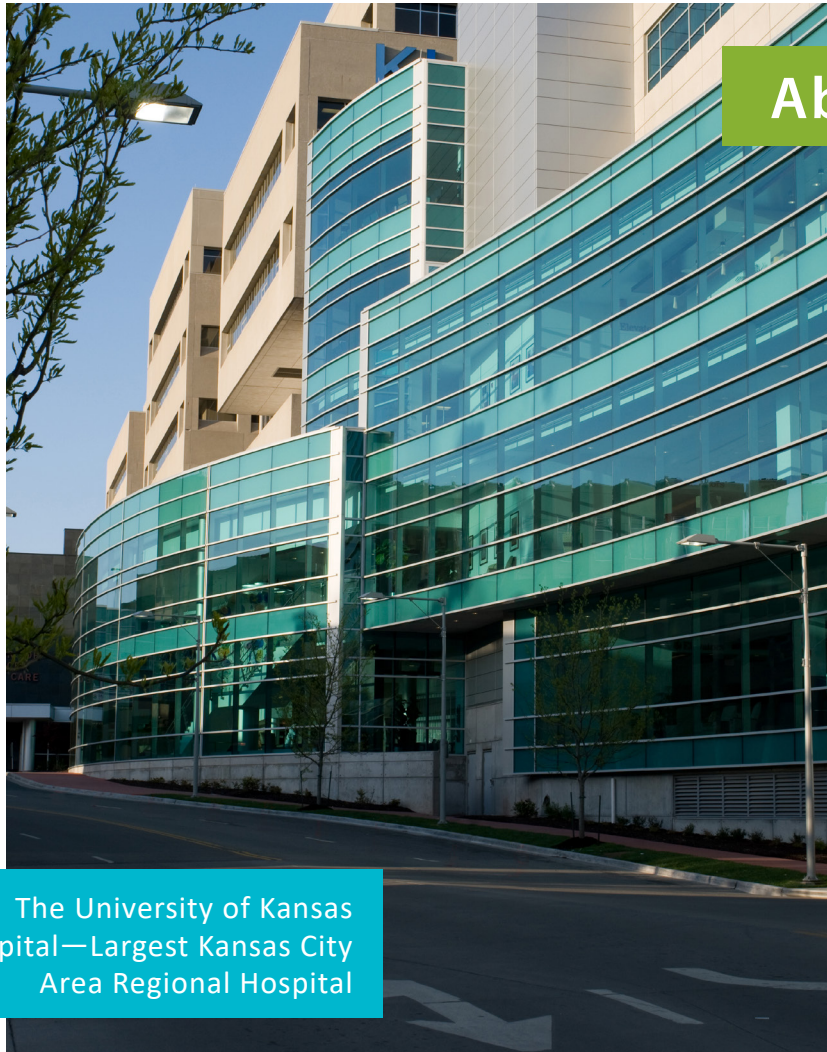
The University of Kansas Hospital—Largest Kansas City Area Regional Hospital