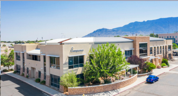
Virtual Mail & Professional Address