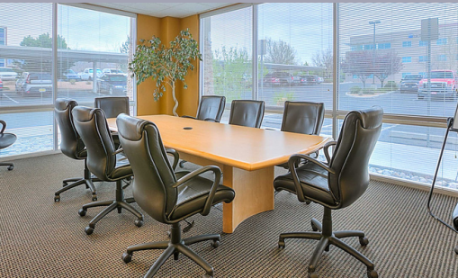
Hourly Meeting Space