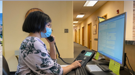
Virtual Telephone Reception