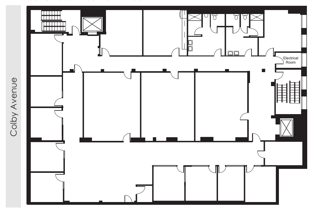
Suite 200: 7406 RSF - Floor 2