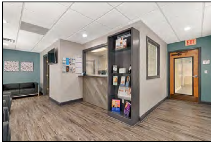
Entry, waiting area, and reception window