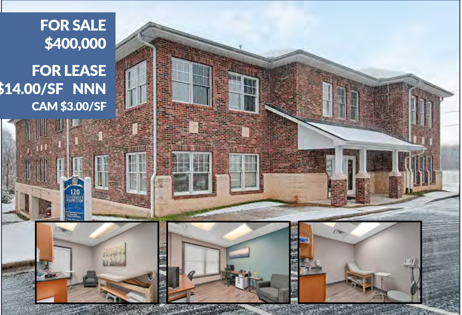
Stately brick at one end of Chadwick Square; Insets: offices