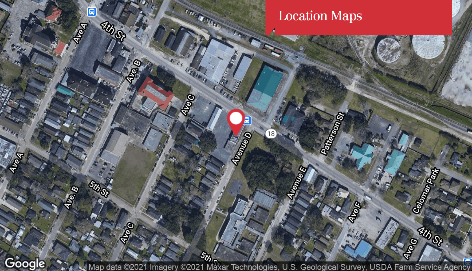
Map data ©2021 Imagery ©2021 Maxar Technologies, Geological Survey, USDA Farm U.S Service Agency