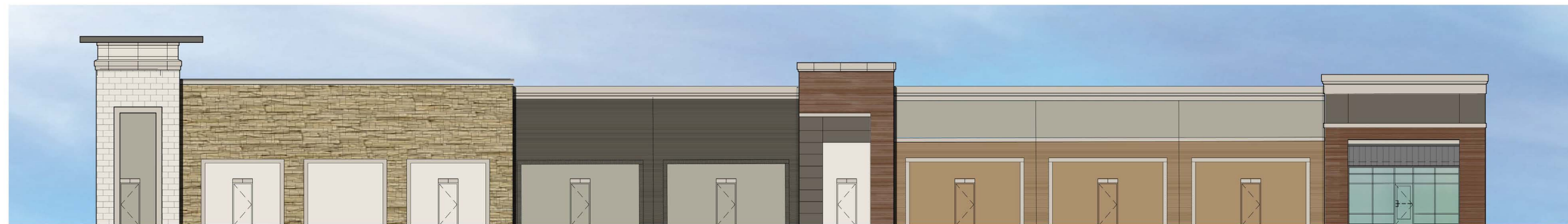
04 (REAR) EAST ELEVATION