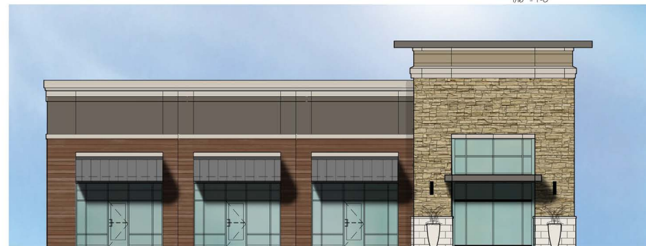
02 (SIDE) NORTH ELEVATION