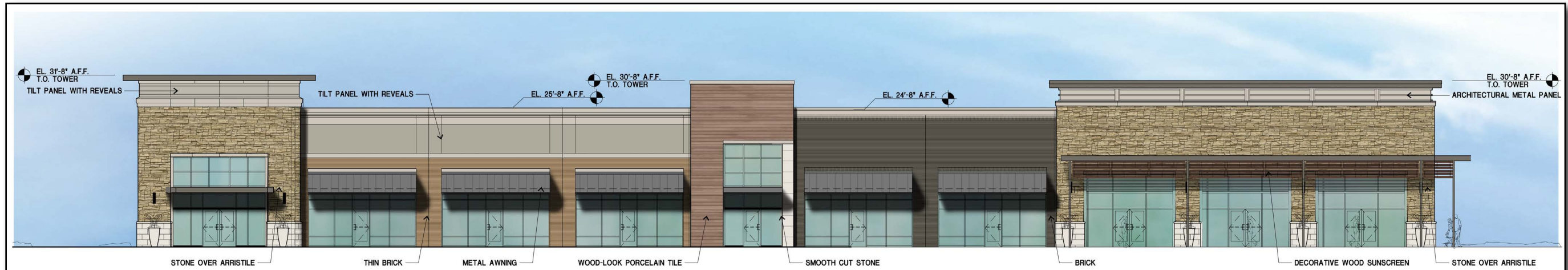
01 (FRONT) WEST ELEVATION