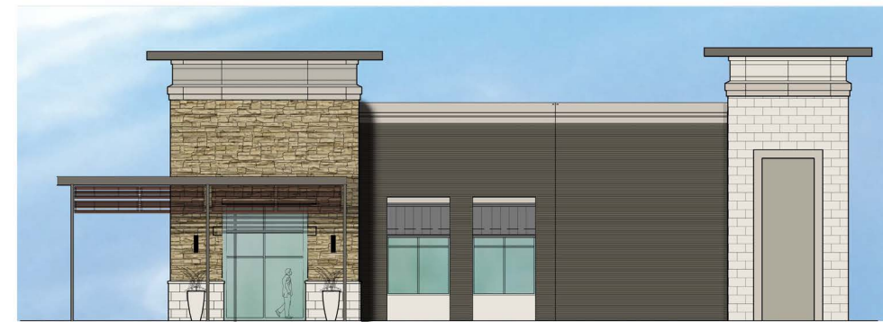
03 (SIDE) SOUTH ELEVATION