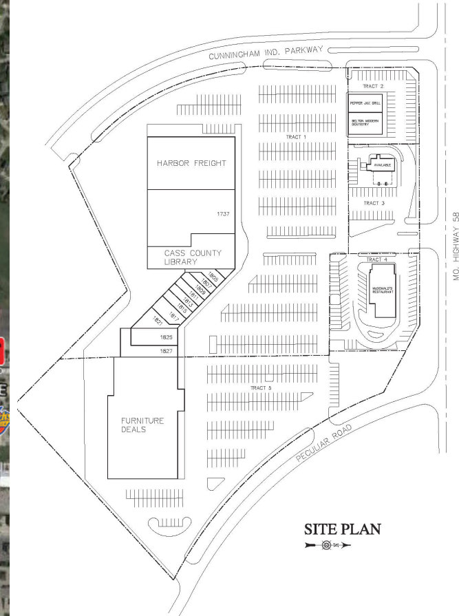
NORTH CASS CENTER BELTON, MISSOURI