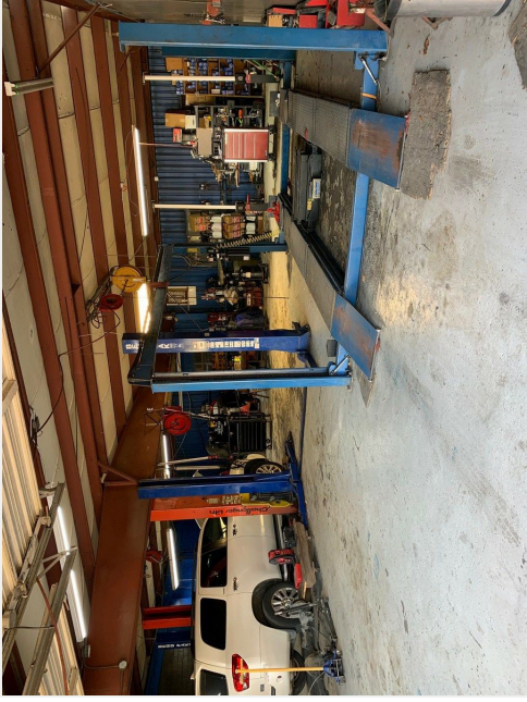
2026 Gessner_Four Bays_Four Lifts