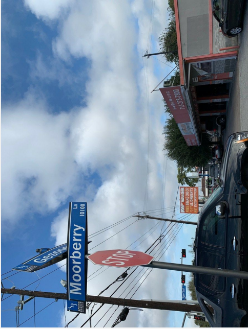
2026 Gessner at Moorberry 77080