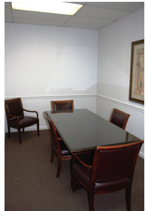
Common Building Conference Room