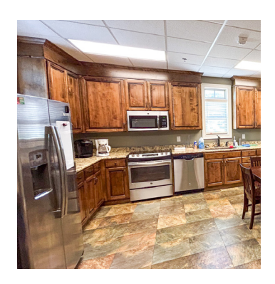
FULL KITCHEN WITH STAINLESS STEEL APPLIANCES