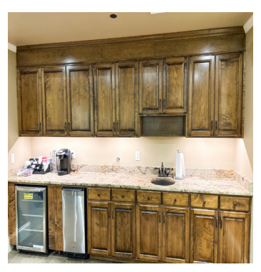
WET-BAR LOCATED IN CONFERENCE ROOM