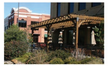
EXAMPLE - OUTDOOR DINING AREA