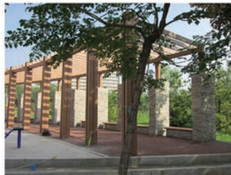
EXAMPLE - SEATING AREA AMENITY