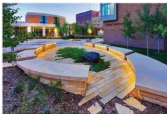
EXAMPLE - SEATING AREA AMENITY