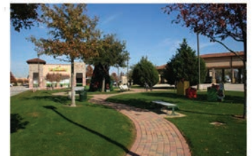
EXAMPLE - AMENITY WALK