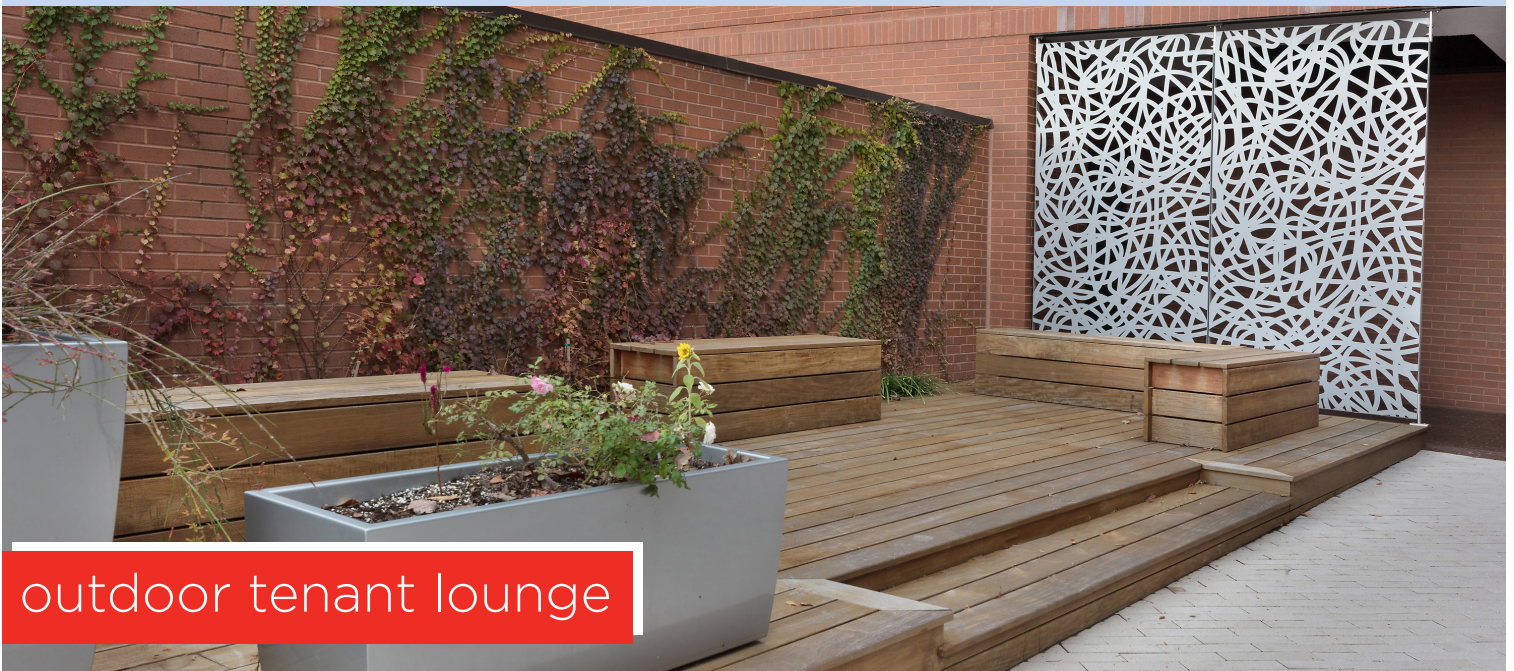
outdoor tenant lounge