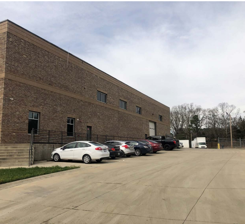
Attractive Brick Exterior & Full Concrete Truck Court