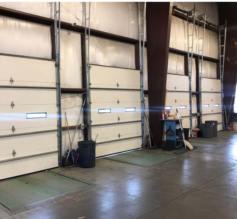
9' x 10' Dock High Doors with View Windows