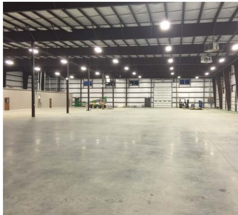
74' Clear Span Staging Bay