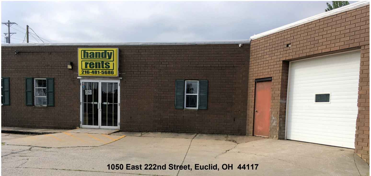
1050 East 222nd Street, Euclid, OH 44117