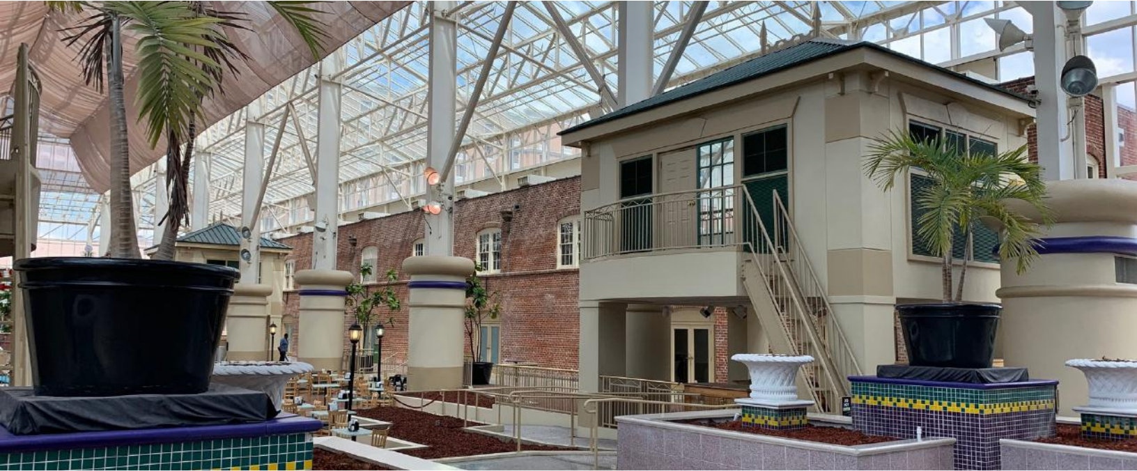
Beauregard Catfish Town Atrium, Baton Rouge, LA