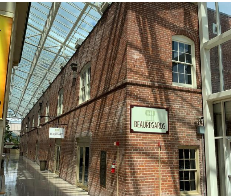
Beauregard Atrium Entry