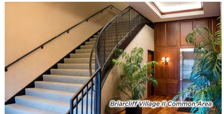
Briarcliff Village II Common Area

For more information visit www.briarcliffkc.com