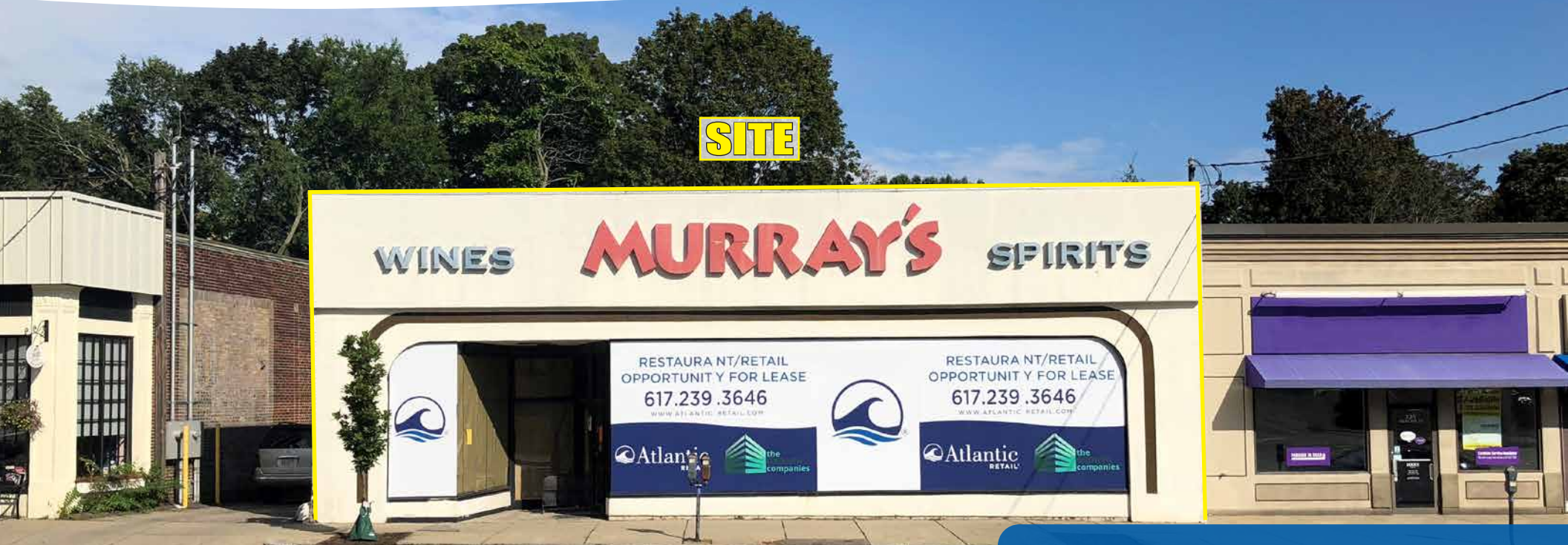
NEW STOREFRONT RENDERING