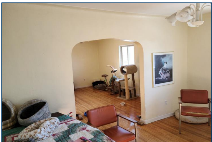
2nd Floor Apartment