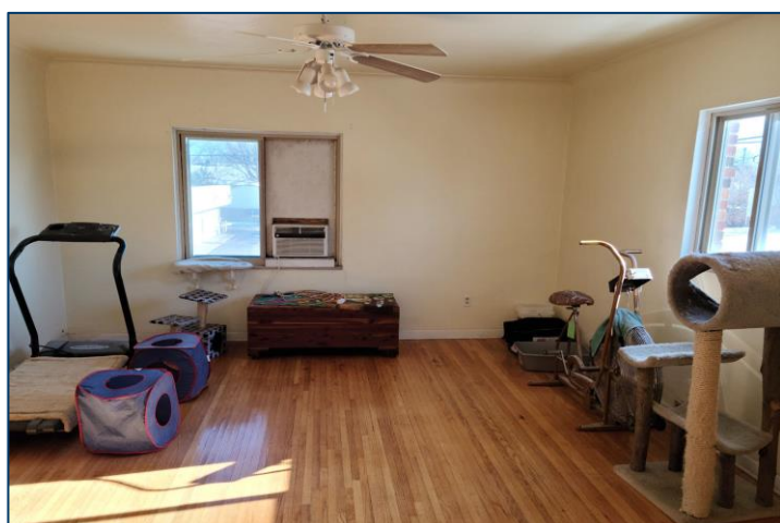
2nd Floor Apartment – Living Room