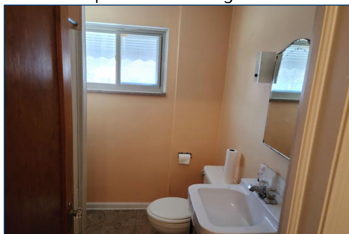
2nd Floor Bath