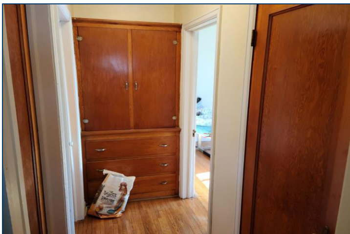
2nd Floor Hallway