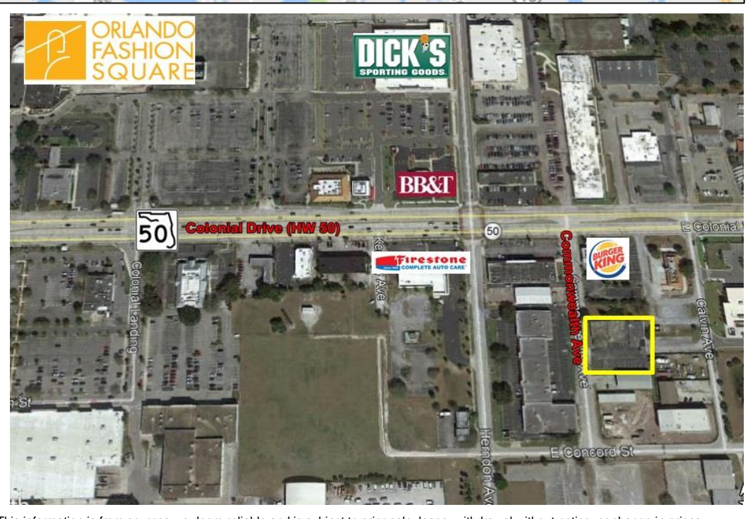
This information is from sources we deem reliable and is subject to prior sale, lease, withdrawal without notice, or change in prices, rates, or conditions. No representation is made as to the accuracy of any information furnished.