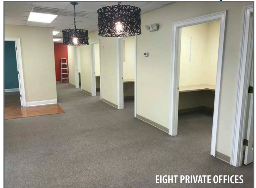
EIGHT PRIVATE OFFICES