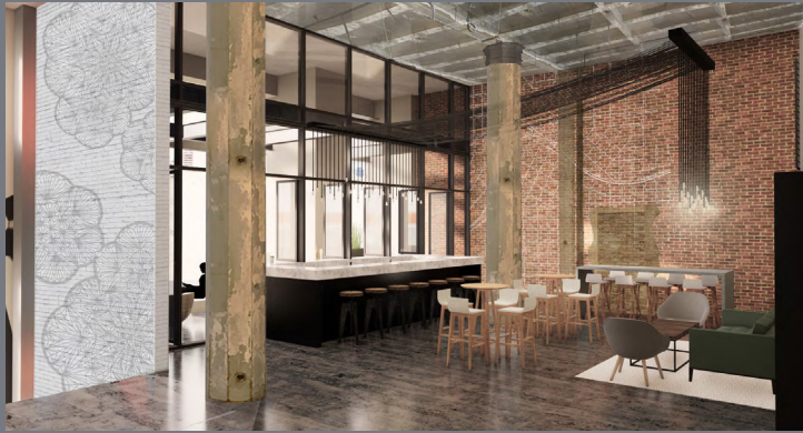
Saito: Sushi, Steak, and Cocktails restaurant in lobby