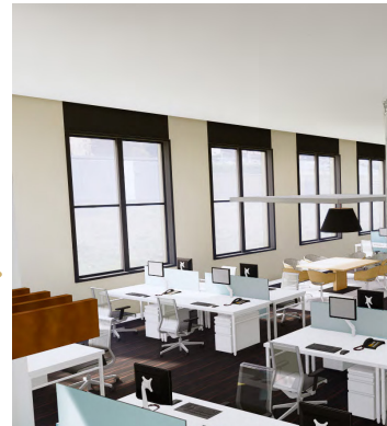
Office conceptual design for 2nd and 3rd floors