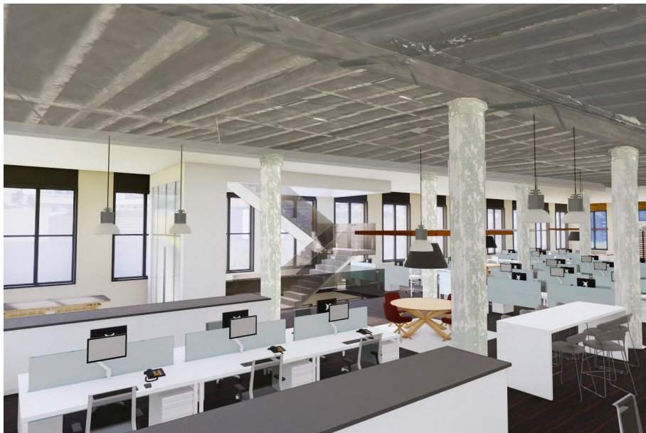
Office conceptual design for 2nd and 3rd floors