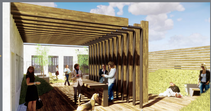
Rooftop amenity deck (optional)