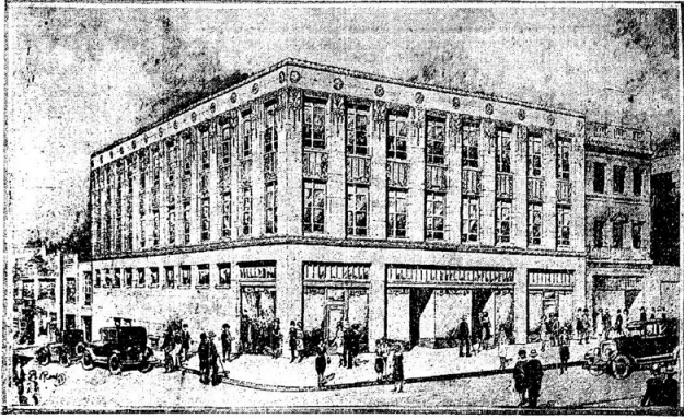
Architect's drawing of the elegant three-story commercial structure being erected on the Peachtree and Cain street corner site of the old First Baptist Church. The major portion of the ground floor and the entire second and third floors have been leased by J. Regenstein Company, prominent woman's wear concern, for its Peachtree street store, to be ready January 1. The corner store was leased to Liggett's Drug Company. Pringle & Smith are the architects.