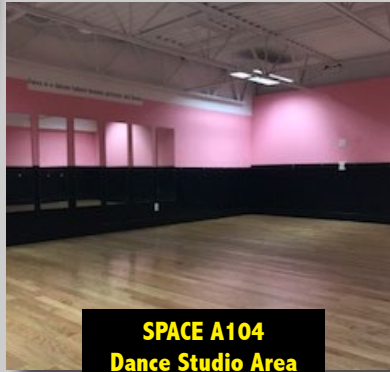
SPACE A104 Dance Studio Area Upstairs - 25' x 18' Main Level - 33' x 25'